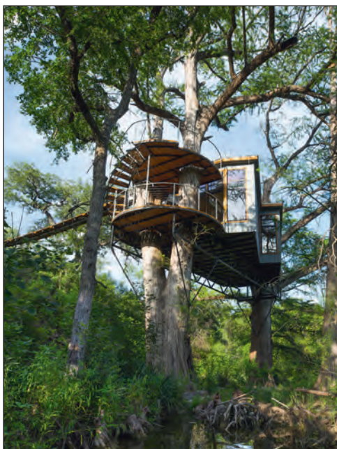
Yoki Treehouse in Austin is one of a series of leafy sanctuaries from design/build firm Artistree Home .